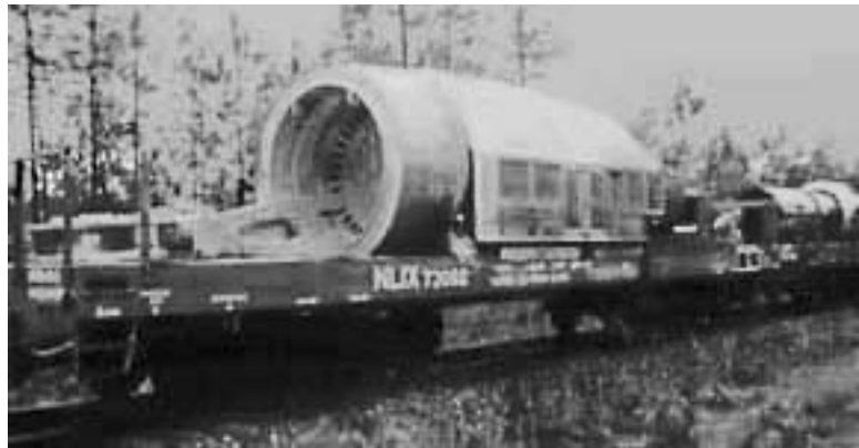
Container for Transporting Used Nuclear Fuel

Additionally, the container remains attached to the rail car and the rail car does not tip over. Because the fuel transport container is not breached, there would be no release of radionuclides to the environment.