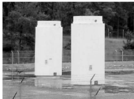
Used Nuclear Fuel Storage Containers